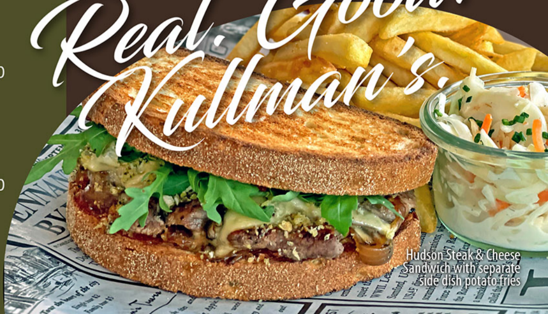
Hudson Steak & Cheese Sandwich with separate side dish potato fries